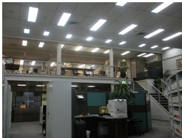
T8 1200 LED Tube (Replaces T8 Fluorescent Tube)